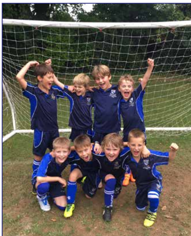
U9 Football Winners v Hurst in their first-ever fixture