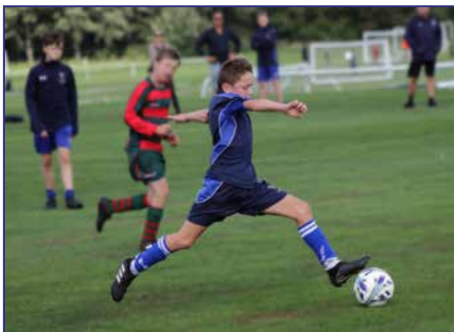
U11 6-a-side tournament at Lancing College