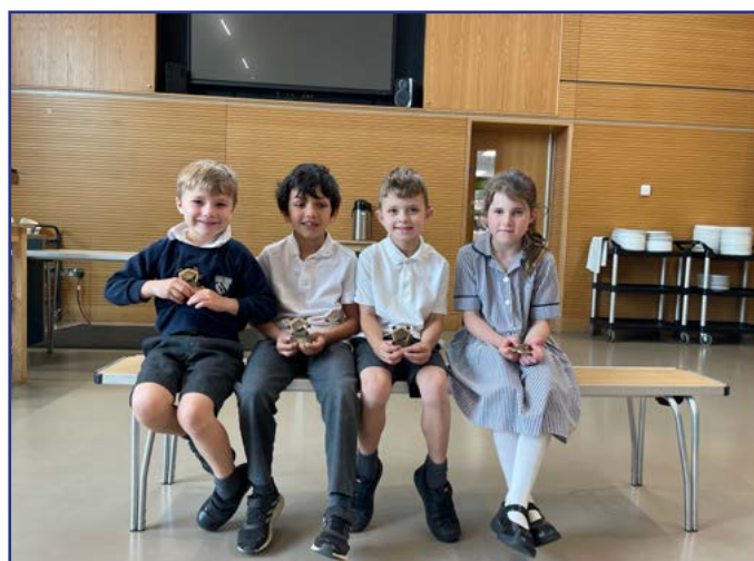
Resourceful Squirrel Award