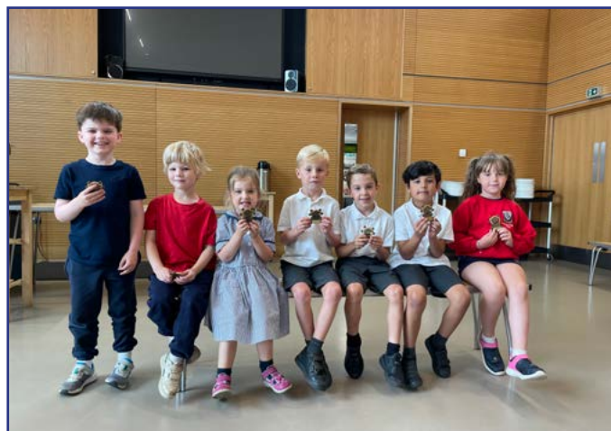
Persevering Tortoise Award