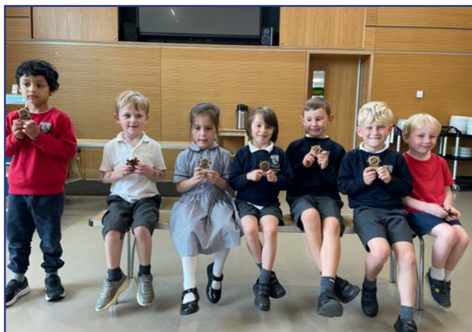
Curious Cat Award