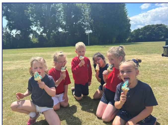
Elsa Pride Winners