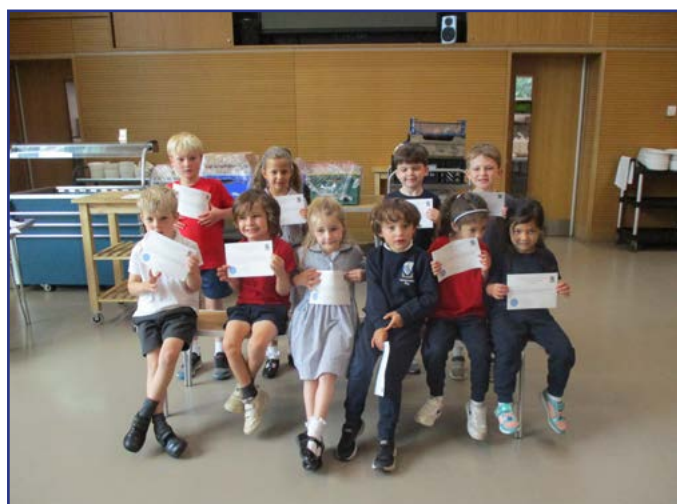
RC Cert Award