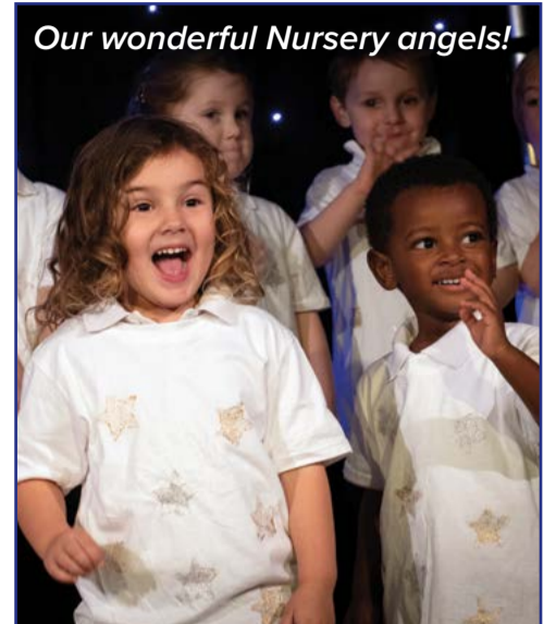
Our wonderful Nursery angels!